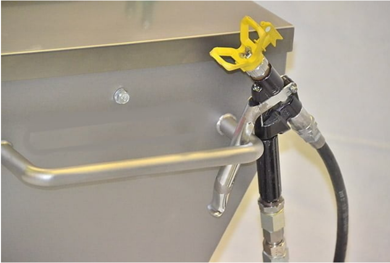
076800E – airless gun XXL-E electric switch