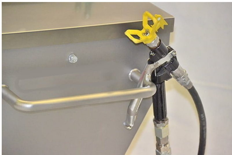
076800E – airless gun XXL-E electric switch