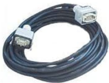
017801 – electric wire kit for remote control