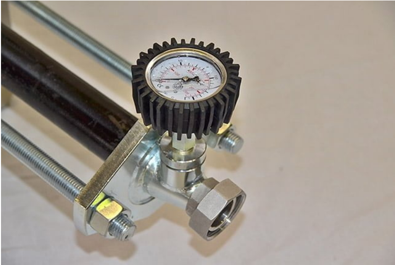
066009 – high pressure gauge kit