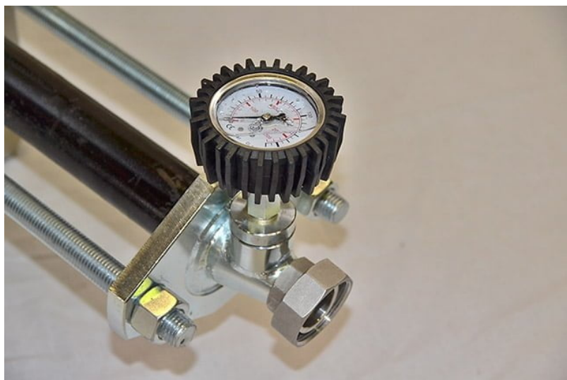
066009 – pressure gauge 40 bar kit