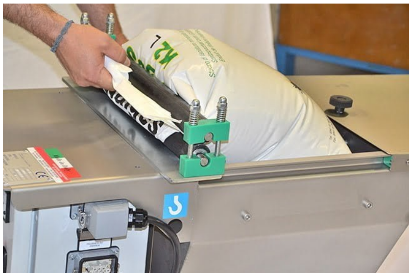
066252 – bag-wrapping MTV 500