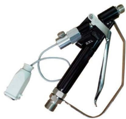
078600E – XXL-E electric switch airless gun