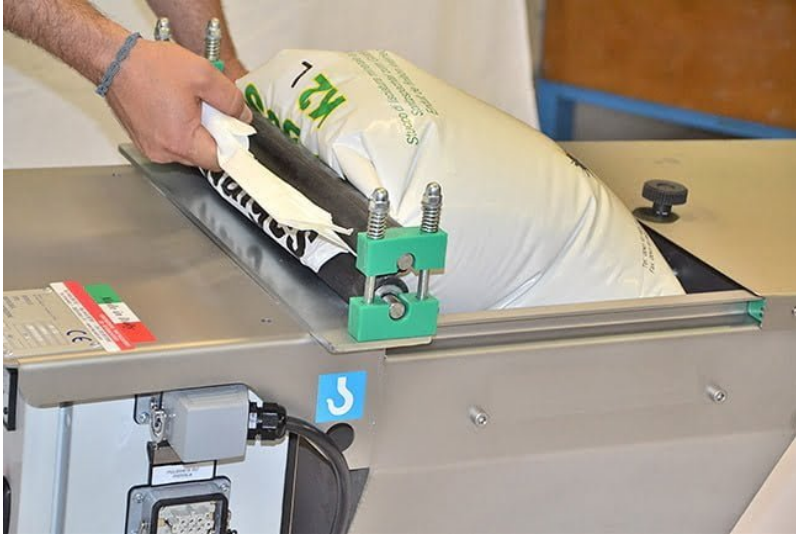
066252 – bag-wrapping MTV 500