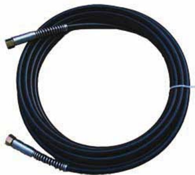
060030 – high pressure hose ø 10 mm, length 10 m.