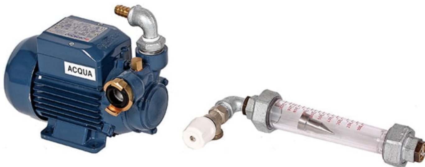
Pompa acqua e flussimetro