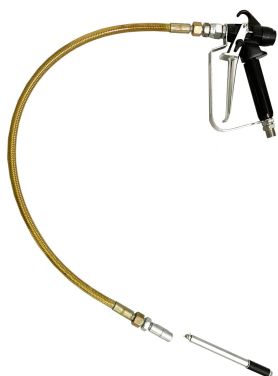
077400 airless gun + 060017 injection kit (50 cm)