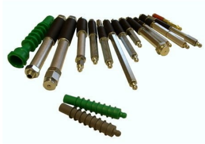
Injection packer (many different models and sizes available)